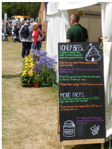
The Secretary at the Norfolk Show, waiting for the crowds to arrive...