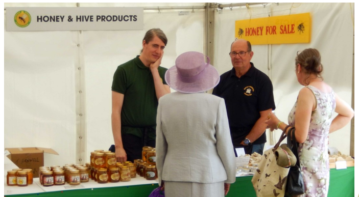
Honey sales seemed to go well, aided by the innovation of a card reader.